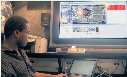
A user views Hawk™ in a mobile command and control center.

Hawk™, one of five Praetorian system components, assembles and manages surveillance information from dispersed sites into a central control workstation.